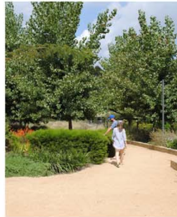
DECOMPOSED GRANITE PATH CAMINO DE GRANITO DESCOMPUESTO