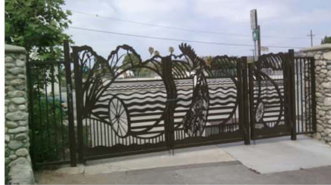
SCULPTURAL GATES / PUERTAS ESCULTÓRICAS