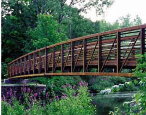
PEDESTRIAN BRIDGE / PUENTE PEATONAL