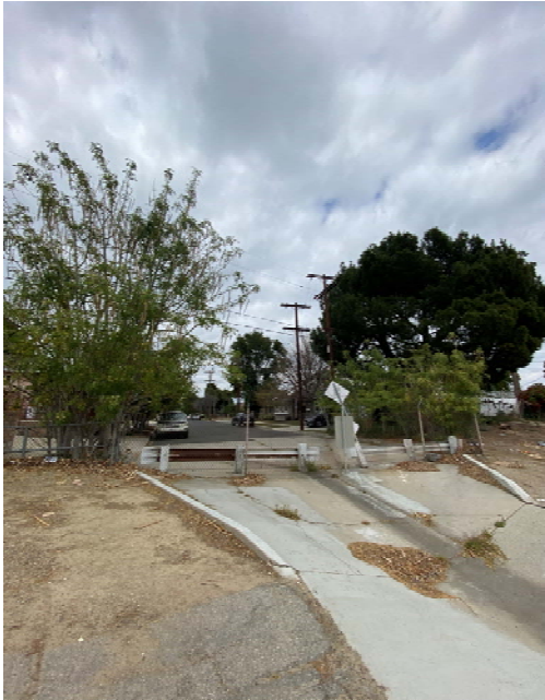
Yolanda Avenue Street End