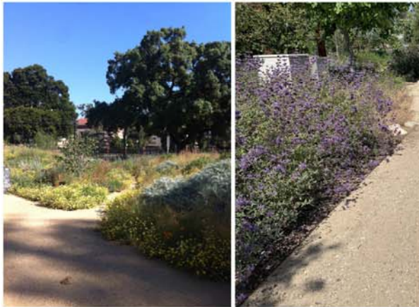
PLANTING / PLANTANDO