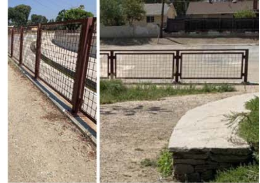
FENCING / LAS CERCAS