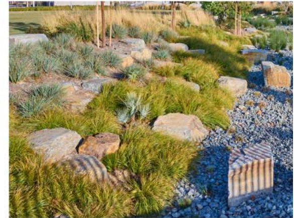
BOULDERS / LAS ROCAS