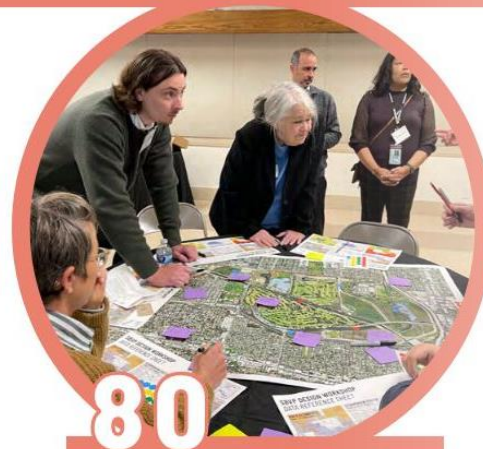
80 INTERESTED PARTNERS